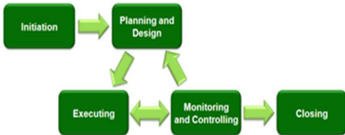
Fig. (1) - steps of traditional project management

Like living organisms the project follows a life cycle spanning from conception, beginning, growth, maturity, decline and termination. Most projects go through similar stages on the path from origin to completion, called the Life Cycle. The project is born (its start up phase) and the manager is selected, the project team and initial resources are assembled, and the work program is organized. Then work gets underway and momentum quickly builds and the progress is made.