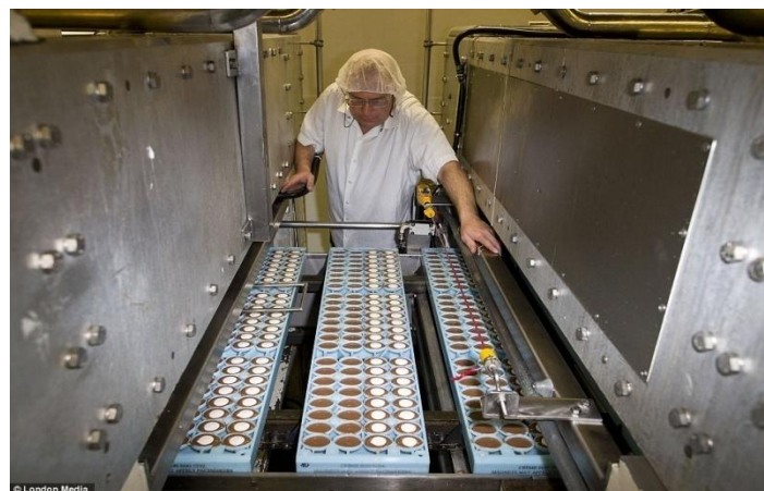
Fig. (2) - chocolate paste department