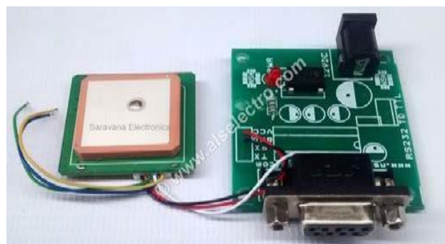
FIG 4: GPS receiver.

It is a navigation and precise positioning tool, tracks the location in the form of longitude and latitude based the GPS coder module used this information to search an exact address of that location as the street name, nearby junction etc. In case where GPS is disabled then the system will only send the longitude and latitude.