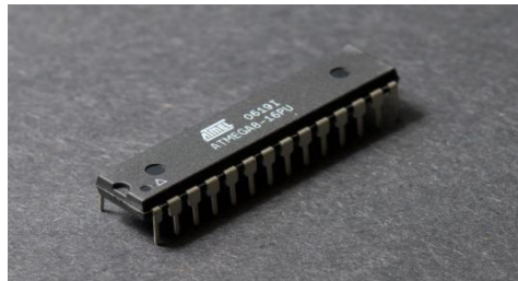
Fig 1 : Atmega 328

converter,programmable watchdog timer with internal oscillator and five software select able power saving modes.the device operates between1.8-5.5volts.