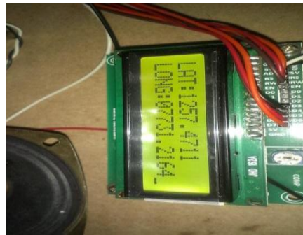
FIG 6: Initial Location Identified

Step 2: The current location is captured by the GPS module and will be displayed on the LCD DISPLAY which is as shown below