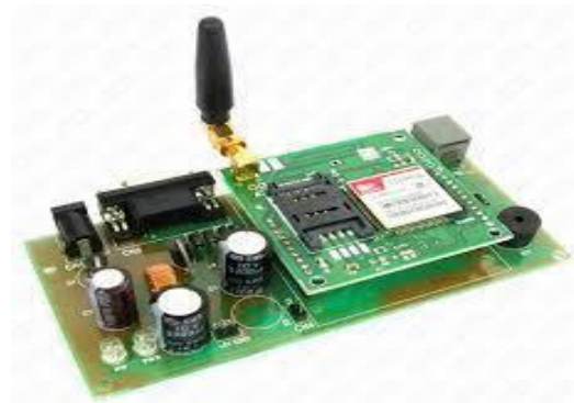
Fig 5: GSM Module

Global System for Mobile communication (GSM) SIM card is inserted inside the mobile device to send and receive the messages using GPRS. The GSM SIM card number is registered with the system. With increasing usage of GSM, network services are expanded beyond speech communication to incorporate many other custom applications, machine automation and machine to machine communication.