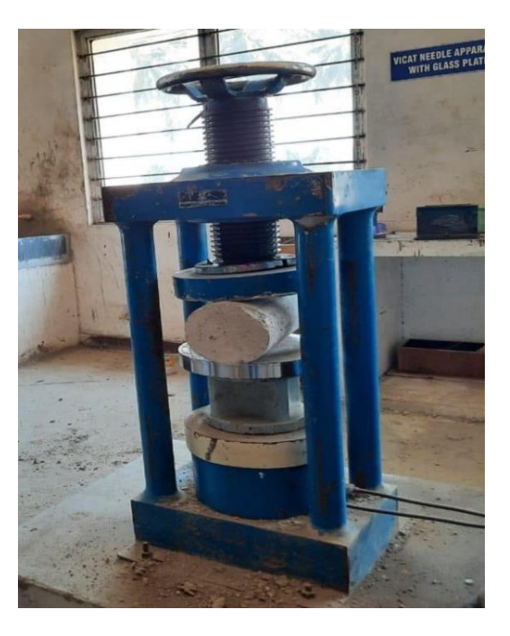
Fig 4.3 - Test Setup for Split Tensile Strength

Vol. No. 10, Issue No. 01, January 2022 www.ijates.com