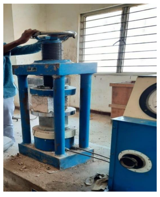
Fig 4.1 - Test Setup for Compressive Strength