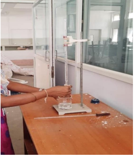
Fig 3.1 - Testing of Treated Wastewater