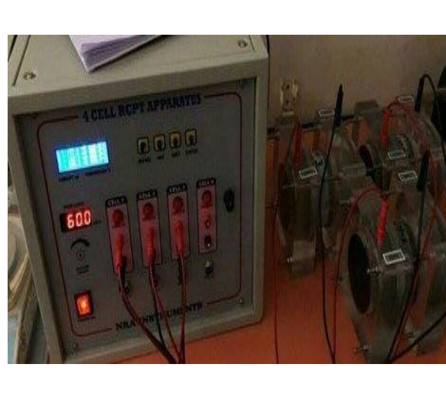
Fig 4.5 - Test Setup for RCPT

Vol. No. 10, Issue No. 01, January 2022 www.ijates.com