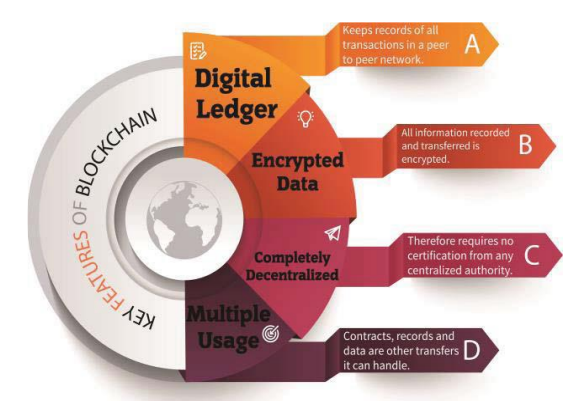
Fig. 2. Key Features of Blockchain

The Bitcoin tackled this issue by a framework that's as of currently loosely referred to as Blockchain development. The Bitcoin system orders trades by putting them in social occasions known as squares and a brief time later interfacing these squares through what's known as Blockchain. The trades in an exceedingly solitary square square measure thought of to own happened meantime. These squares square measure related to one {another} (like a chain) in an authentic immediate, ordered demand with every square containing the hash of the past square. There still remains one issue. Any center within the framework will accumulate unproven trades and build a square and at that time conveys it to remainder of the framework as a suggestion relating to that square ought to be the concomitant one within the blockchain. However, will the framework choose that square ought to be next within the blockchain? There may be totally different completely different} squares created by different center points meantime. One cannot depend upon the demand since squares will converge at totally different completely different solicitations at different concentrations within the framework.