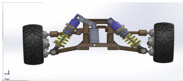
Fig -: CAD model

System design in Solid Works is given as follows:-