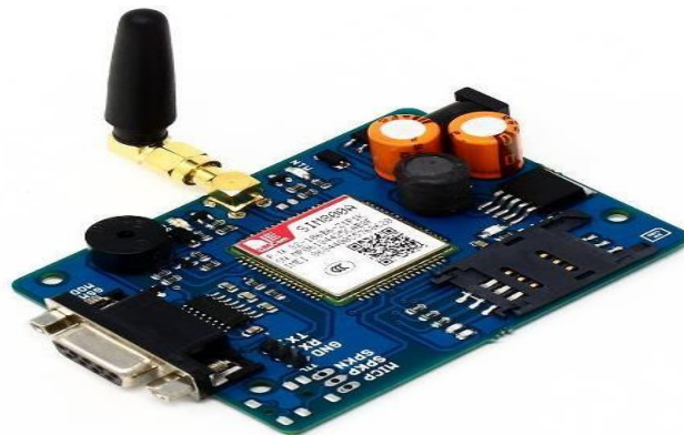
Figure 4: GSM Module