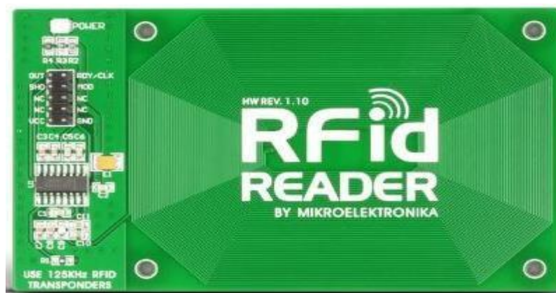
Figure 3: RFID Reader

An RFID Reader (Fig 3) can read through most anything with the exception of conductive materials like water and metal, but with modifications and positioning, even these can be overcome. The RFID Reader emits a low-power radio wave field which is used to power up the tag so as to pass on any information that is contained on the chip. In addition, readers can be fitted with an additional interface that converts the radio waves returned from the tag into a form that can then be passed on to another system, like a computer or any programmable logic controller [2]. Passive tags are generally smaller, lighter and less expensive than those that are active and can be applied to objects in harsh environments, are maintenance free and will last for years.