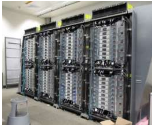
Figure 3 Blue Brain Storage Rack