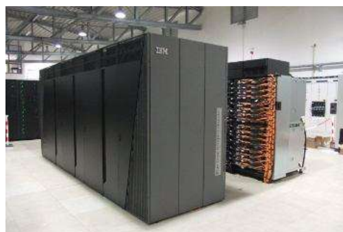
Figure 5 JuQUEEN Super Computer in Germany