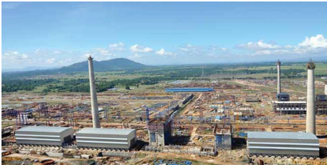
Fig 2. Kalinganagar project , Odisha, India

The designing of the plant has been done with an emphasis on recycling waste. While waste gas from the coke oven and blast furnace will be fuelling the power plants thereby reducing dependence on fossil fuels, slag from the blast furnace will be supplied as raw material to cement manufacturing units in the nearby areas. A zero liquid discharge plant, the waste water will be processed in an effluent treatment plant and recycled for use in the plant. [9] Fig. 2 shows the pictorial view of Kalinganagar project.