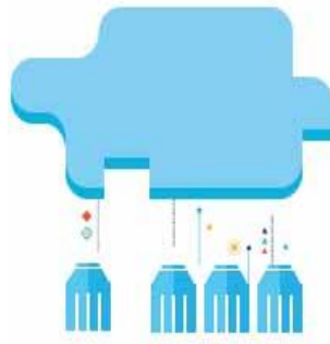
Figure 1.Public Cloud

1. Public cloud: Its ownership is by a service provider and all the resources are accessible publicly. End users have the option of renting and adjusting resources based upon their requirement.