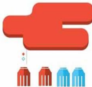
Figure 3 Community Cloud

3. Community cloud: It is similar to Private cloud but here resources are shared between members of a closed group who have the same needs.