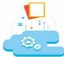
Figure 5 Platforms as a Service (PaaS)

6. PaaS: Platform as a service provides a cloud-based environment with everything required to support the complete life cycle of building and delivering web-based (cloud) applications—without the cost and complexity of buying and managing the underlying hardware, software, provisioning and hosting. Google Apps is an example of PaaS.