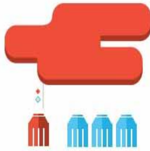
Figure 2.Private Cloud

2. Private Cloud: Is owned or rented by single organization for its private use only.