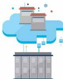
Figure 6 Infras tructure as a Service (IaaS)

7. IaaS : Infrastructure as a service (IaaS) Infrastructure as a service provides companies with computing resources including servers, networking, storage, and data centre space on a pay-per-use basis.