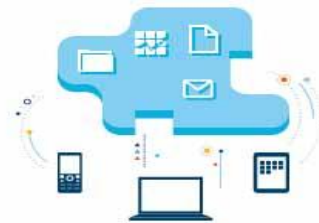
Figure 4 Software as a Service (SaaS)

5. SaaS : Software as a Service (SaaS)—run on distant computers “in the cloud” that are owned and operated by others and that connect to users’ computers via the Internet and, usually, a web browser. Such as ERP, CRM, and HRM. [13][14].