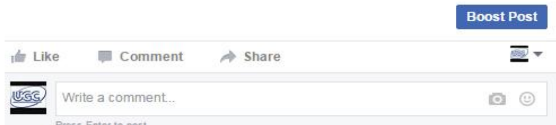
Fig A: Boost the post

Step 2: After uploading, click into boost post.