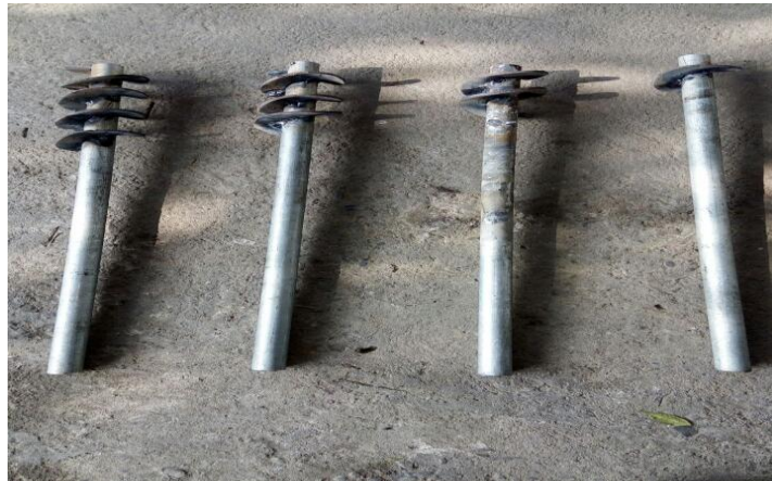
Figure 1. Helical Screw anchors

used for piers in harbours. Made originally from cast or wrought iron, they had limited bearing and tension capacities. Modern screw pile load capacities are in excess of 2000 kN, (approx. 200 tonne). Large load capacity screw piles may have various componentry such as flat half helices, Bisalloy cutting tips and helices, cap plates or re-bar interfaces for connection to various concrete or steel structures.